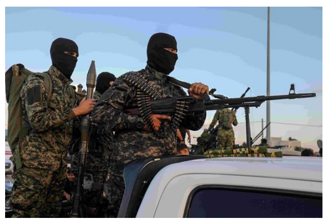
Hamas terrorists drive fully armed through Gaza's streets on ceasefire day.

BUT until then, Israel must release 1,904 Palestinian convicted criminals, withdraw from Gaza, the Gazans are allowed to return to their areas of origin and Hamas remains in power.