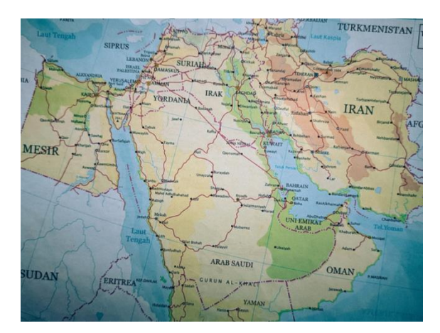
Israel is under attack from many sides.

And the fact that Hamas deliberately misuses clinics as shields continues to be deliberately ignored. Accordingly, Israel is condemned every time it attacks terrorists in a medical facility - even though international law clearly defines that the use of an institution by terrorists legitimizes such an attack.