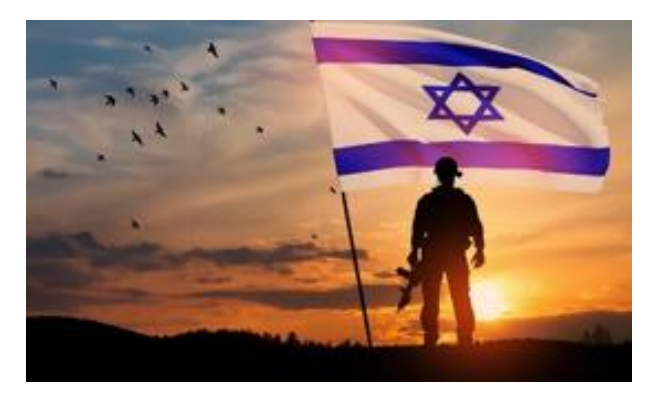
Today, Israel is no longer defenseless.

The decisive difference to the situation 85 years ago is therefore not the reaction of world public, but the fact that the Jews are no longer defenseless today. The fact that there is an Israeli defense force that protects and fights for its citizens. For the liberation of the hostages, for the return of the evacuees and for security within the Israeli state.