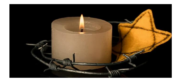
Have we learned from the mistakes of our ancestors?

After October 7, I wrote the article "<u>The Second Chance</u>". It deals with the failure of our ancestors to prevent the inconceivable crime of the Holocaust committed by the National Socialists and their accomplices.