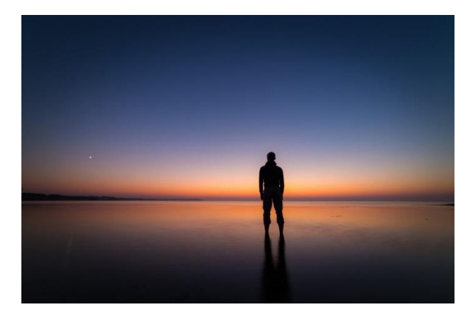
Every individual can make a difference.

But the summary of this time would be incomplete if I did not mention the "unnamed heroes". Because they do exist! Just like 85 years ago, in 2023/2024 there were once again individuals who did not look away, who have consciously dealt with the situation and the suffering in Israel and took responsibility. Who tried within their means to be a voice for Israel and to help. Who have not allowed themselves to rest for over a year and who have surpassed themselves in their efforts.